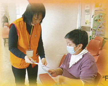
「同路人」朋輩關懷服務 Peer Support and Care