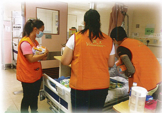
住院病人活動 Activities for In-patients