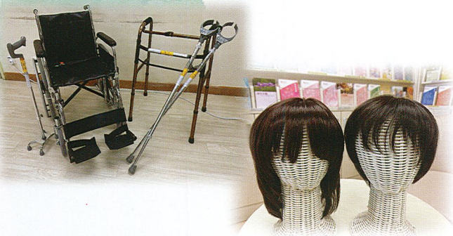
復康用品租用服務 Equipment Loan Service