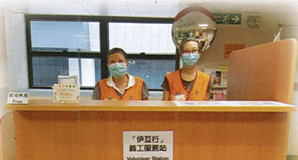
病人接待及院內護送服務 Patient reception and escort service

發展、組織及督導義工服務以改善病人的照顧 Develop, coordinate and monitor volunteer services for patients