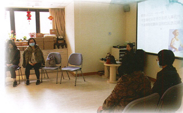
社會心理支援服務 Psychosocial Support