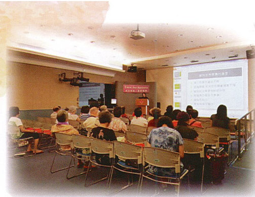
癌症及心理講座 Talks on Cancer and Psychological Care