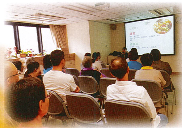
新症病人護理講座 Healthcare Program for New Patients